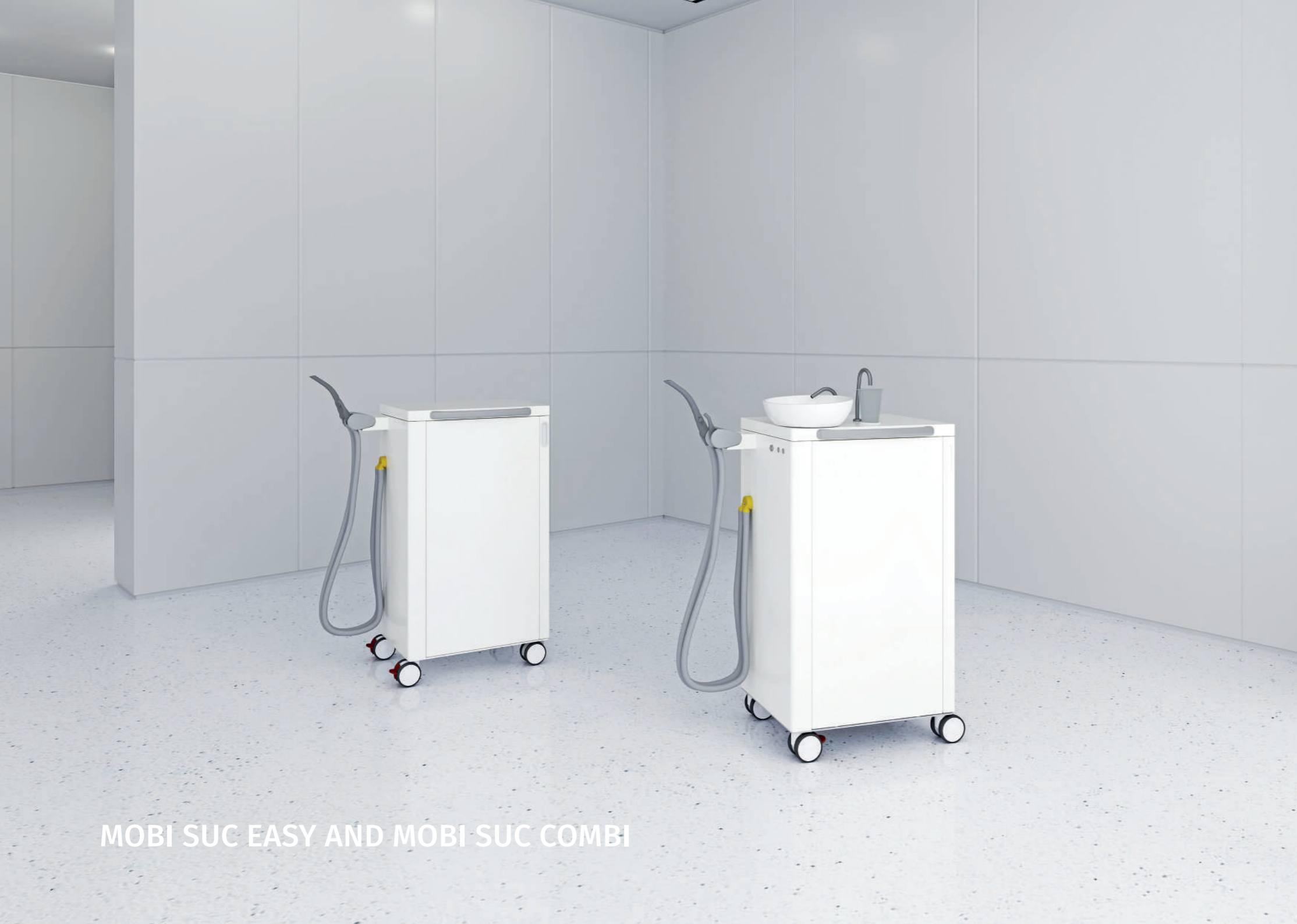
MOBI SUC EASY AND MOBI SUC COMBI