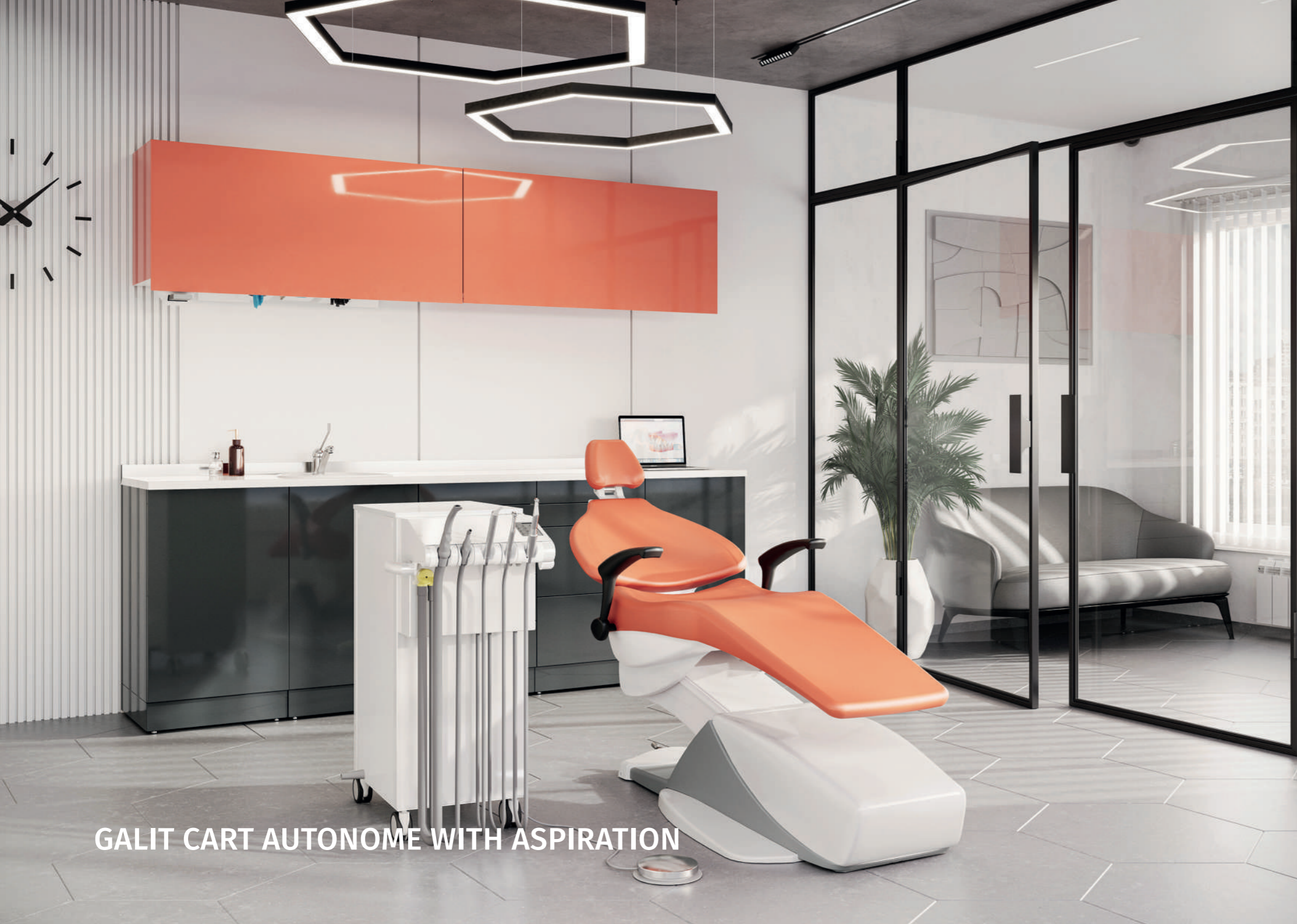
GALIT CART AUTONOME WITH ASPIRATION