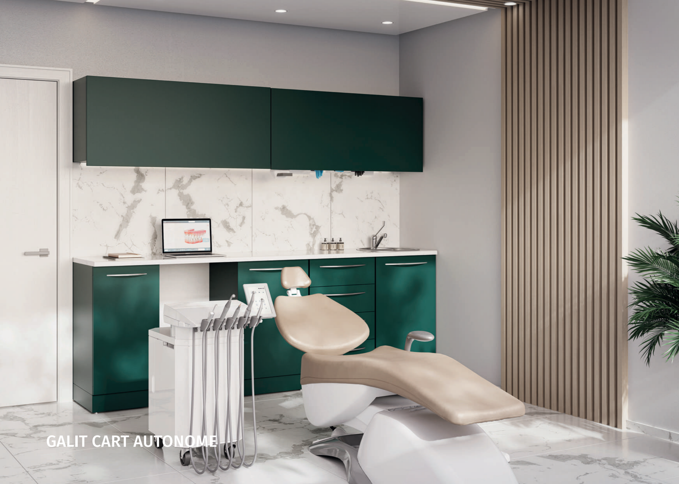
GALIT CART AUTONOME