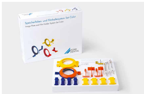
Image plate holder system

Image plate holders from Dürr Dental offer optimum protection for the image plate with their smoothed and rounded edges. Holders are available for all applications – using them helps to ensure that accurate X-ray images are produced.