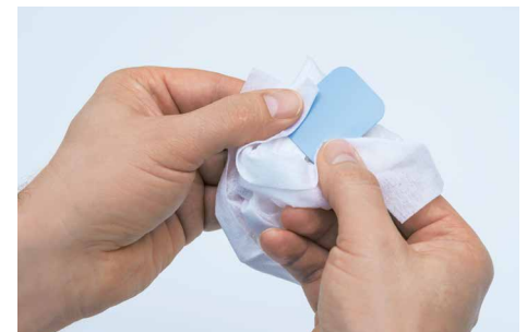
Image Plate Cleaning Wipe

These are perfectly tailored for a digital workflow with image plates or sensors and are also suitable for use with conventional systems.